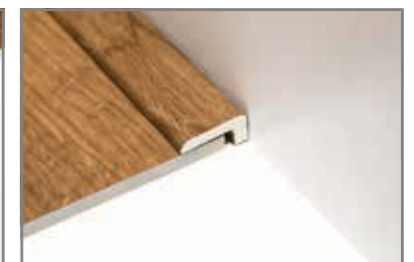
▲ L ANGLE