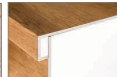
▲ STAIR NOSE